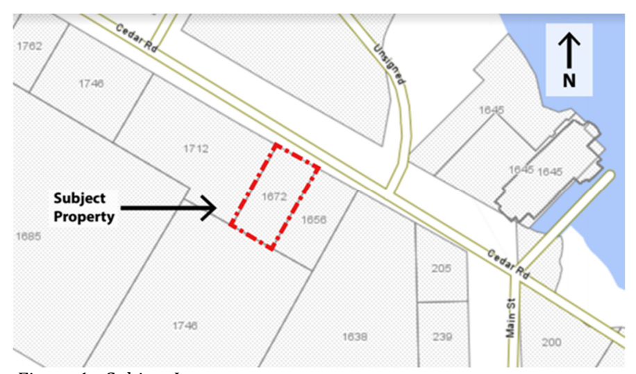
Figure 1 - Subject Lot

To provide Council with information on an application to amend Zoning Bylaw No. 1160, 2013 (the " Zoning Bylaw ") to allow a combined residential/commercial use on the ground floor of a proposed mixed use building located at 1672 Cedar Road, PID 006-167-926, Lot D, Plan VIP4011, District 09 ( Figure 1 ).