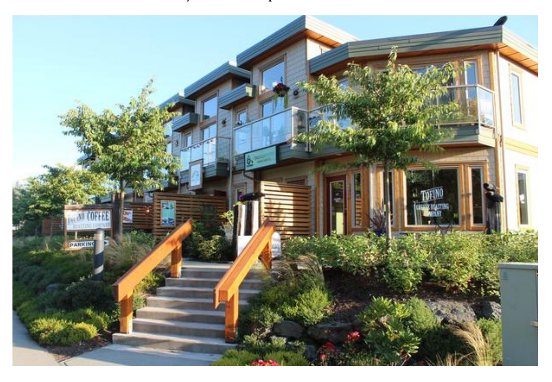
Figure 3 – The Gateway

The applicant has requested to amend the zoning bylaw to allow for a mixed residential commercial unit on the ground floor. This mixed use within a unit is allowed in other communities, usually know as a "Live /Work" use. For example, Tofino has a recent development called "The Gateway" which is the traditional Live/Work concept: